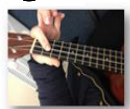
Chard of G - Step 1 -First finger