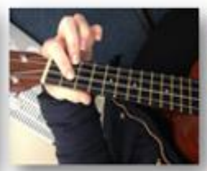
Chord of G - Step 2 -Add your middle finger